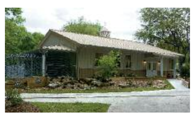
YOUR DOG'S PAVE BONE RESORT